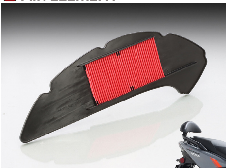
REPLACEMENT AIR ELEMENT FOR STOCK AIR CLEANER.